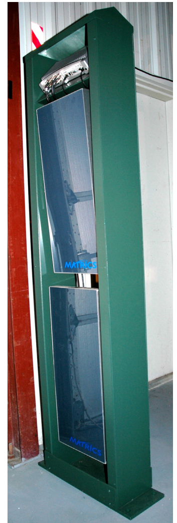
SmartDoor™ at a dock door portal.

Available in almost any color and with clear or tinted facings.